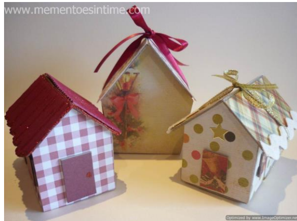
Two mini houses and a bird box. The base is tied on with ribbon and can be opened to put small gifts inside.