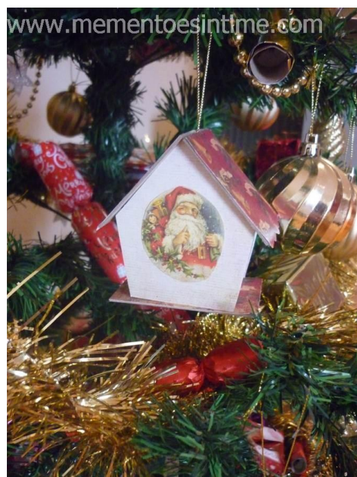
Papered Bird Box Tree Decoration