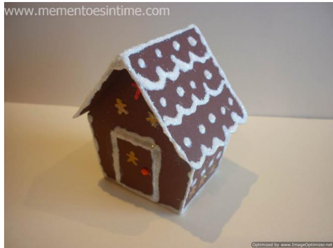
Mini Gingerbread House made with the Bird Box Template

We are taking a short break to fit in some Christmas activities but will be back with a few more projects very soon.