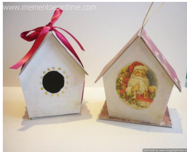
Two Bird Boxes